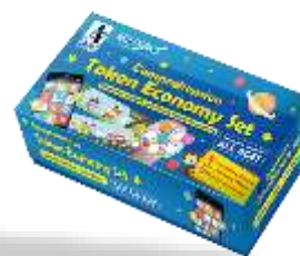
Token Economy Set