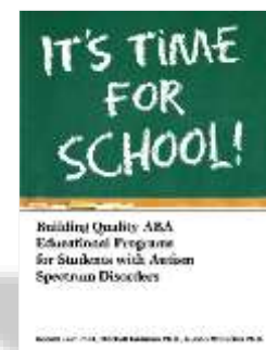
It's Time for School!