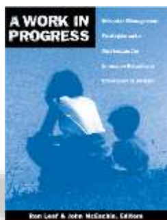
A Work In Progress