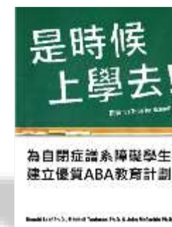
It's Time for School! (Chinese Version)