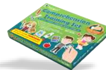
Comprehension Training Set