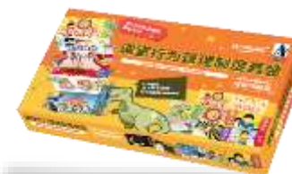
Group Behavior Management System Chart Set (Chinese)