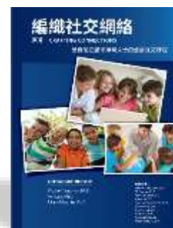
Crafting Connections (Chinese Version)