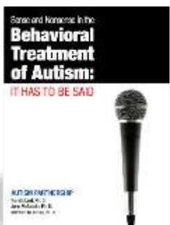
Sense and Nonsense in the Behavioral Treatment of Autism: It Has To Be Said