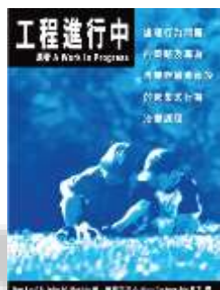
A Work In Progress (Chinese Version)